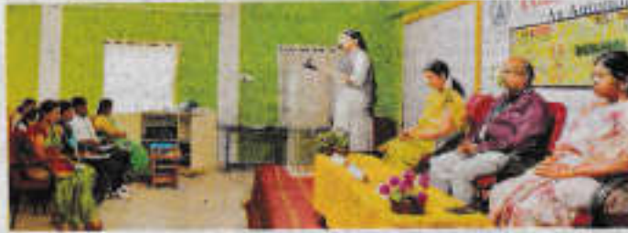
■ கெங்கராப்பாளையம் ஐ.எப்.இ.டி., பெருநிலையில் கல்லூரியில் தேசிய மகளிர் தின விழா நடந்தது.

புதுச்சேரி, பிப். 18- கெங்கராப்பாளையம் ஐ.எப்.இ.டி., பெருநிலையில் கல்லூரியில் தேசிய மகளிர் தின விழா கொண்டாடப்பட்டது.